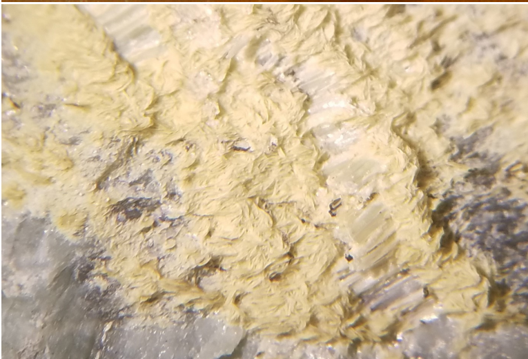
Close-up of Pyroaurite from HK Peachbottom

More photos of mineral specimens collected in June & July 2018 at the Haines-Kibblehouse Peachbottom, PA quarry in the State Line Chrome District of Lancaster Co., PA