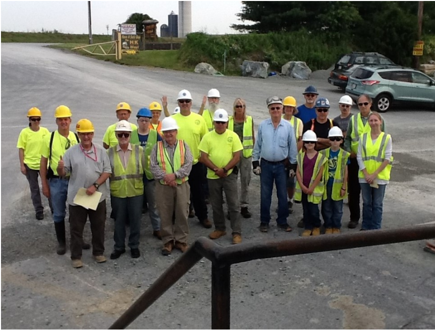
June and July 2018 at the Haines-Kibblehouse Peachbottom, PA quarry in the State Line Chrome District of Lancaster Co., PA