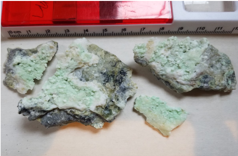
Green magnesite from HK Peachtree

More photos of mineral specimens collected in June and July 2018 at the Haines-Kibblehouse Peachbottom, PA quarry in the State Line Chrome District of Lancaster Co., PA