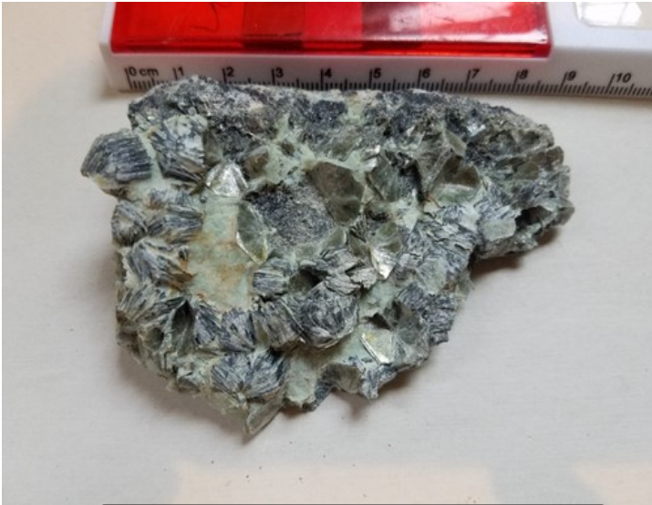
Clinocllore from HK Peachtree, PA