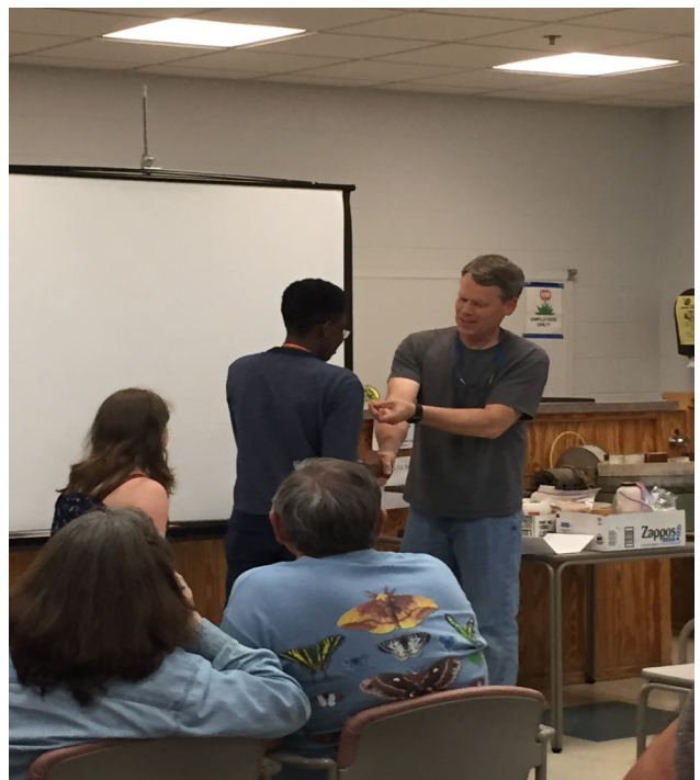
FRA members receiving badges at the June 11th meeting