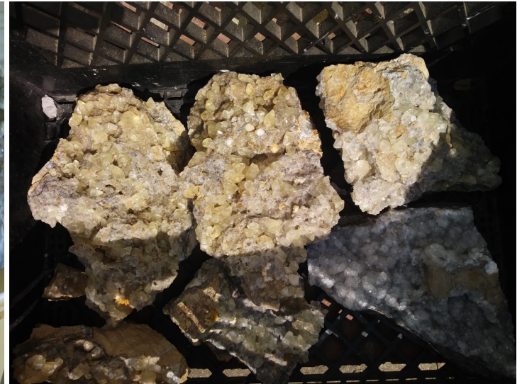
Calcite from Middleburg and Mount Pleasant Mills