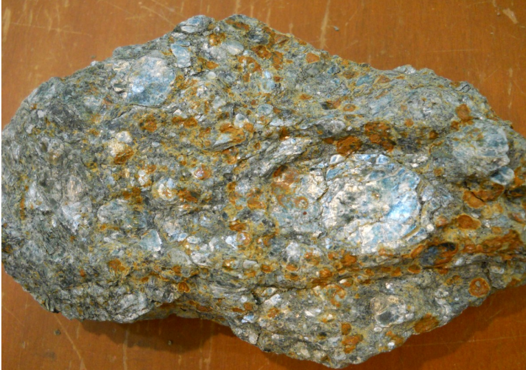
Vermiculite from Penn-MD