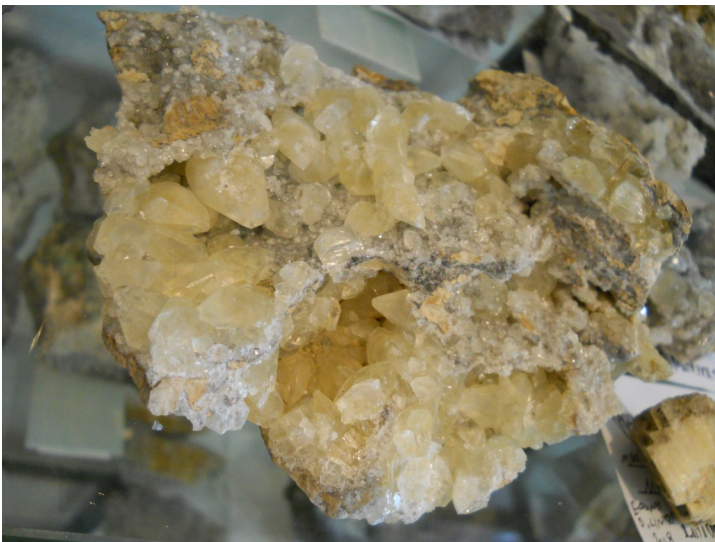
Calcite from Mount Pleasant Mills