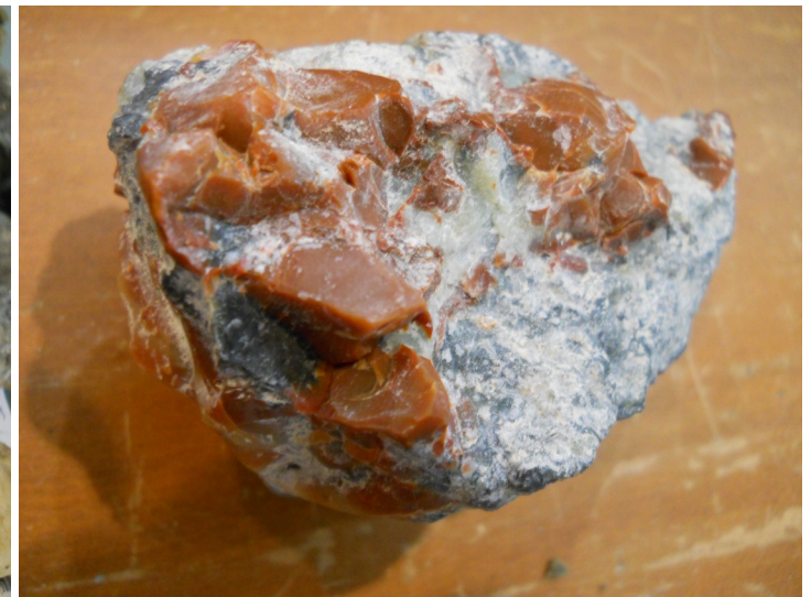
Deweylite from Penn-MD