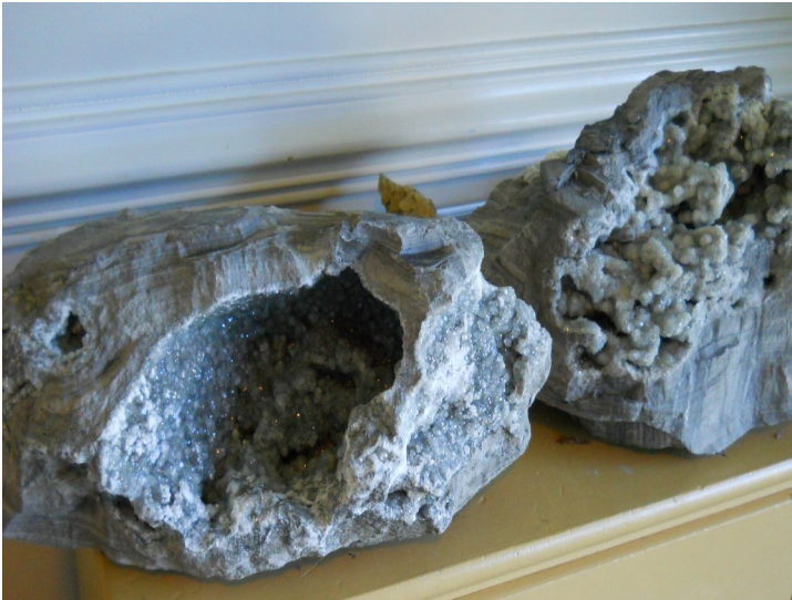
Calcite from Middleburg Quarry, July 2018